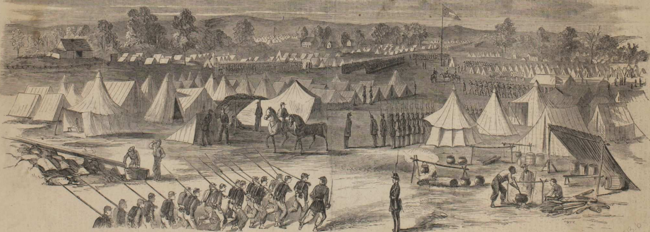
GENERAL BEAUREGARD'S CAMP OF CONFEDERATE TROOPS AT WHITE SPRINGS, VIRGINIA, NEAR THE MANASSAS GAP RAILROAD.—[SEE PAGE 443.]