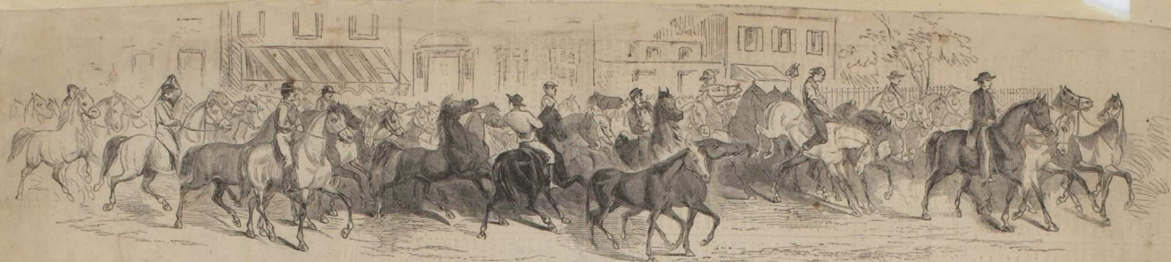
ARRIVAL OF HORSES AT WASHINGTON FOR THE ARMY.—[SKETCHED BY OUR SPECIAL ARTIST.]