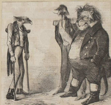
THE CRIPPLED AMERICAN EAGLE, THE COCK, AND THE LION.

"Stand aside, you Old Sinner! WE are HOLIER than thou!"