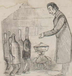
A Slight Difference.

Officer.—ATTENTION! CAN'T YOU HEAR! EYES TO THE FRONT! RIGHT DRESS! WHY CAN'T YOU OBEY