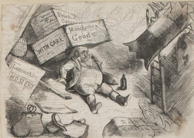
Mr. Bull in his Big Ship "NEUTRALITY" Floundering about in the Sea of Commercial Distress.

NARRATING TO THE CENTRAL CLUB OF PHILADELPHIA HOW HIS GRANDFATHER AIDED THE COUNTRY BY COLLECTING THE STAMP-DUTY, AS AN "OFFICER OF THE CROWN," UNDER THE PROTECTION OF A BRITISH MAN-OF-WAR, AND WHAT HIS FATHER'S OPINIONS WERE REGARDING TEA-DRINKERS AND TORYISM.