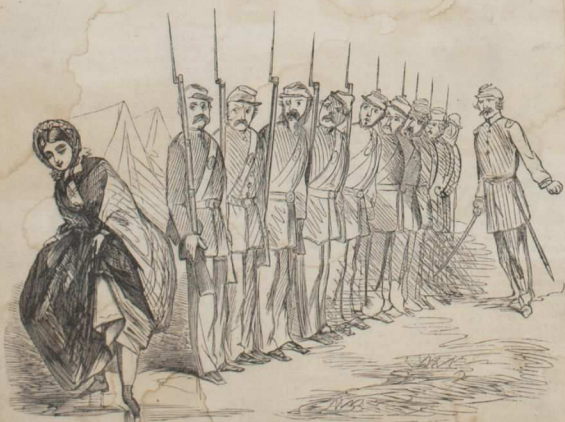
An Impossible Order to Obey.

LION. "Why, Brother Jonathan, you don't look so fierce as you used. How about the MONROE DOCTRINE now?" COCK. "Yes, my good Jonathan, what you tink of PRIVATERING under de present cir- cumstance?"