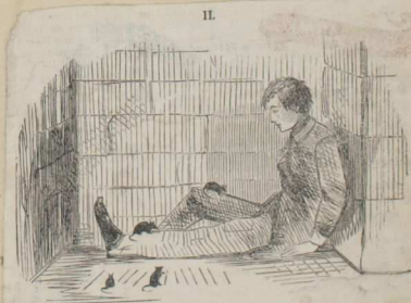
CHRISTMAS VISITORS TO OUR BRAVE BOYS CONFINED IN PRISON DOWN SOUTH.

CHRISTMAS VISITORS TO THE REBEL PRISONERS AT FORT WARREN, BOSTON HARBOR.