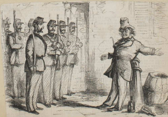
OCCUPATION OF FLORENCE—SOUTH CAROLINIAN GARRISON. GENTLEMAN (apologetically)—"I was born intended to fear, and I don't desert my post!"