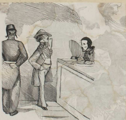
A POWERFUL DEFENCE. JUSTICE—"So, young man, you've been talking Secesh in the street." YOUNG SWELL—"No, sir—I deny it—I merely said that Abe Lincoln ought to be hung, and that Jeff Davis was perfectly right! That's all I said!"