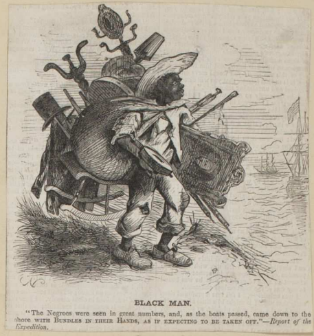
"The Negroes were seen in great numbers, and, as the boats passed, came down to the shore with BUNDLES IN THEIR HANDS, AS IF EXPECTING TO BE TAKEN OFF."—Report of the Expedition.