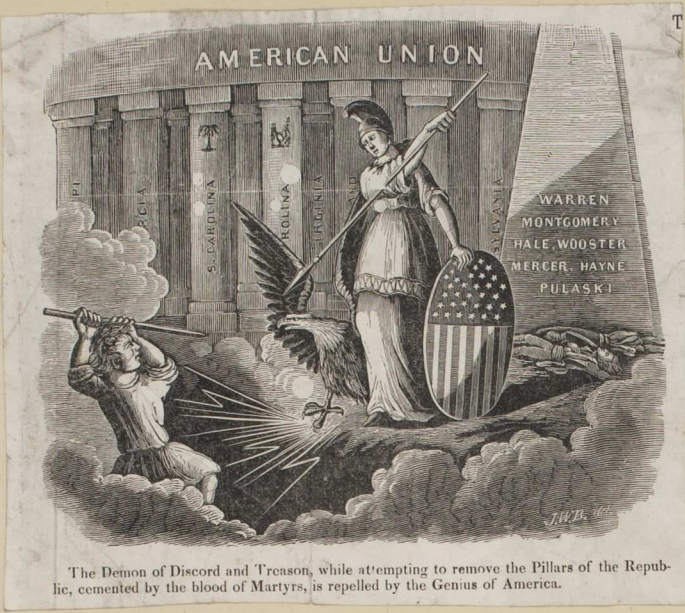
The Demon of Discord and Treason, while attempting to remove the Pillars of the Republic, cemented by the blood of Martyrs, is repelled by the Genius of America.