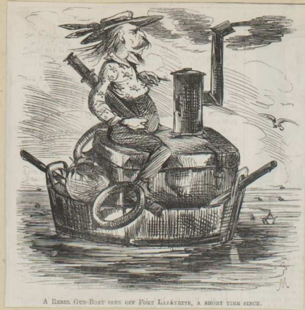
A REBEL GUN-BOAT SEEN OFF FORT LAFAVETTE, A SHORT TIME SINCE.