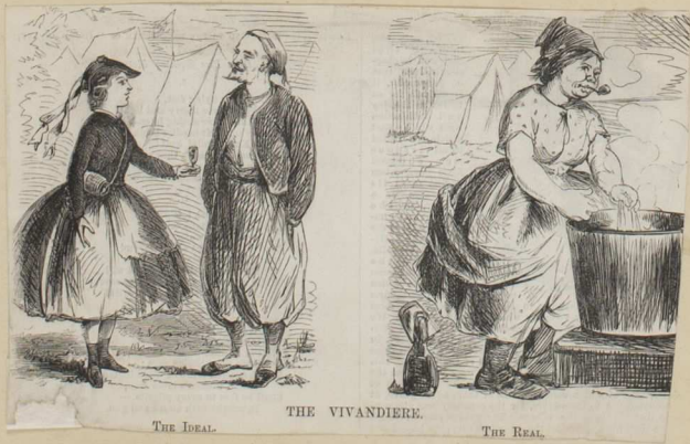
THE IDEAL. THE VIVANDIERE. THE REAL.