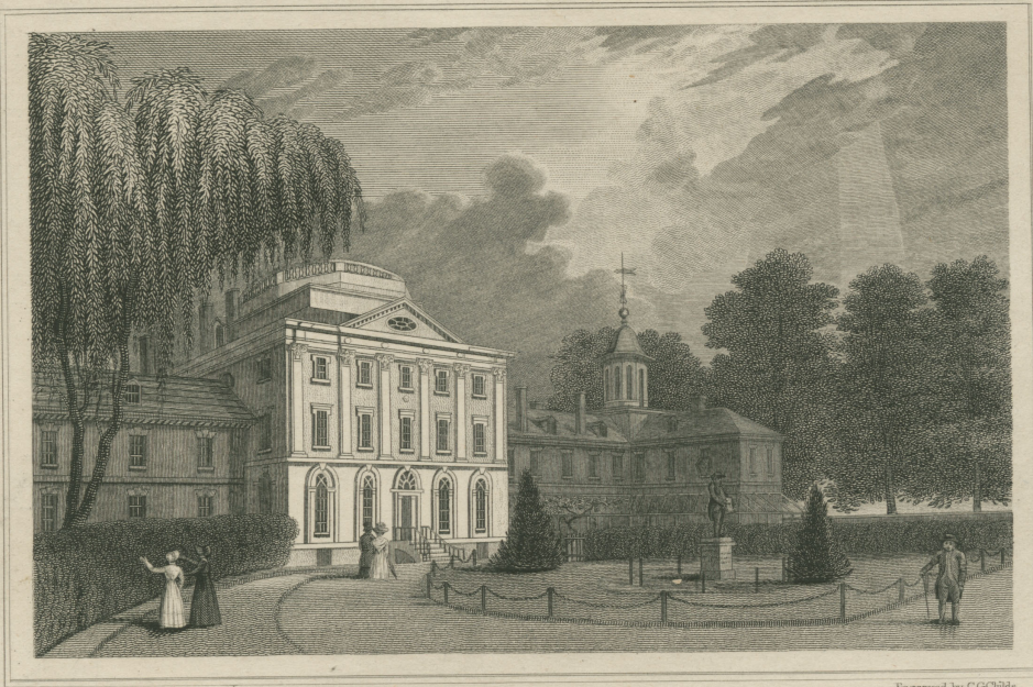
Drawn by Geo. Strickland.