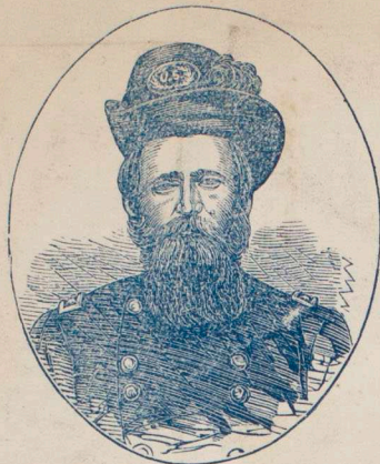
MAJOR GENERAL GRANT, THE HERO OF FORT DONELSON.

General Grant's reply to Buckner on the terms of surrender:—